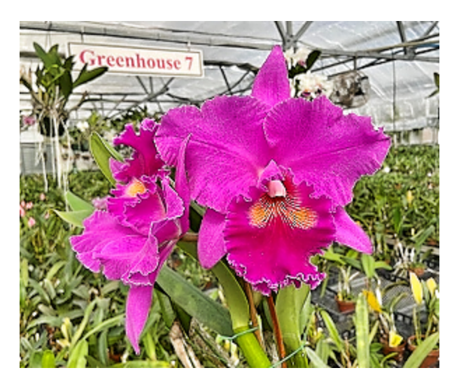
District I Fund Raiser